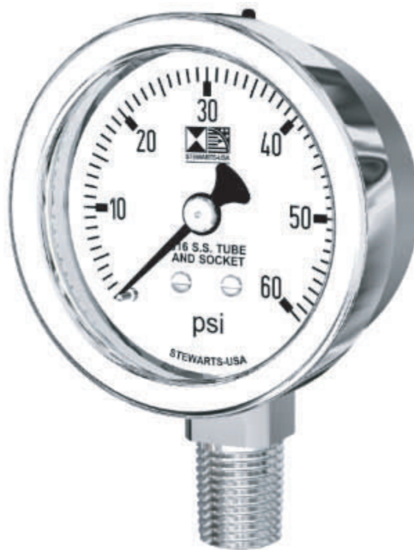
Model Shown: 30S - 60 To order other models by part number, see below.