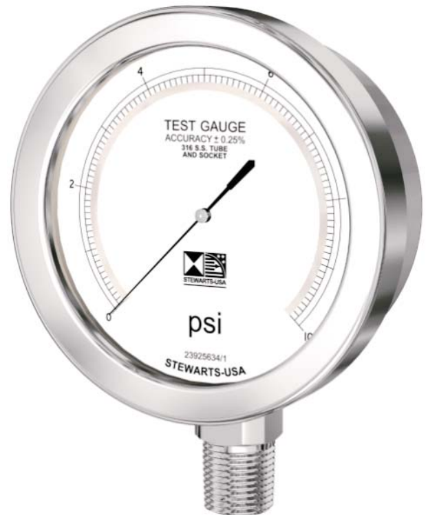
Model Shown: 45ST-10 To order other models by part no, See Below.

Standard Direct Mounted (Bottom Vertical). LB: Lower Back Connection. FP: Front Flange for Panel Mounting. C: C-Clamp Fixing for Panel Mounting. R: Rear Flange for Wall Mounting.